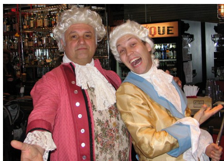
Salieri (left) and Mozart entertain the crowd at Bobbique.

It was also a great concert with a near sellout crowd in the Philharmonic's first Patchogue Theatre performance.