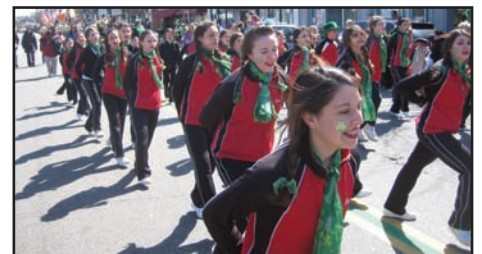
The Stage Door Dancers were a winner at the St. Patrick's Parade.