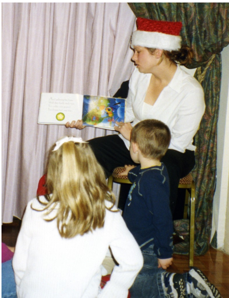
Story time at Breakfast with Santa. More than 150 children attended.

Please help. All donations go to Brookhaven Town children.