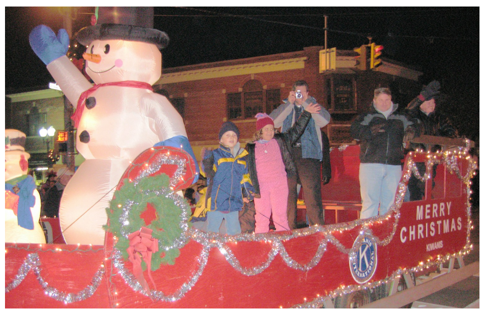
Patchogue Kiwanians displayed a great effort in the Nov. 26 Main Street parade. The parade organized by the Village Recreation Department lasted an hour and a half.