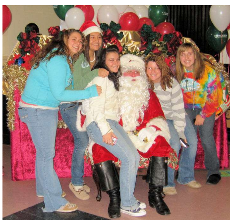
Santa and helpers at Breakfast with Santa.

Dec. 18—Chamber Board of Directors, Temple Beth El, 8:00 a.m.