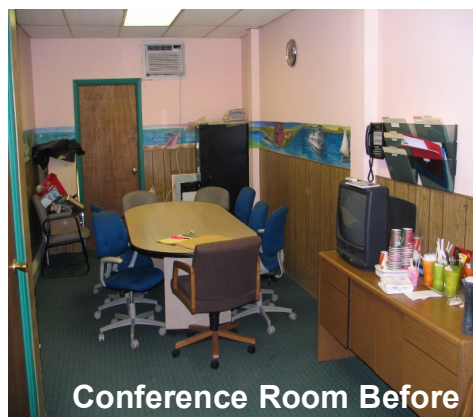
Conference Room Before