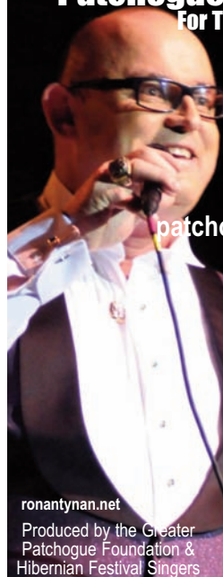
Patchogue Theatre, Feb. 27, 2010