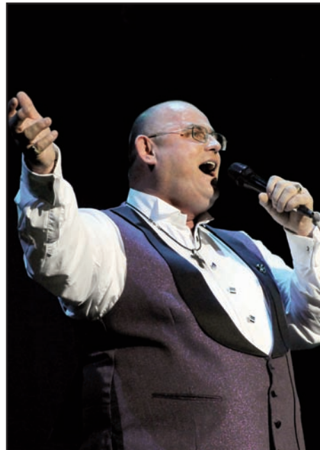
Patchogue Theatre, Feb. 26, 2011.