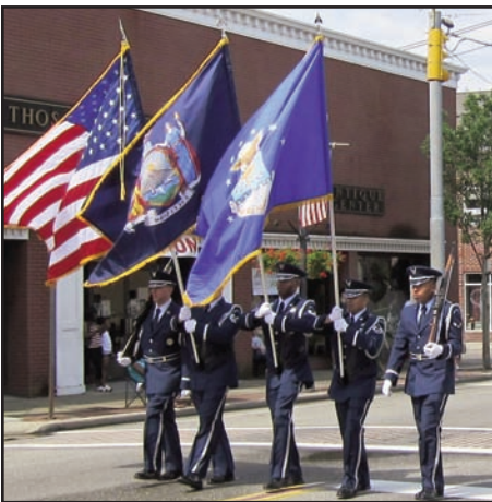
A glorious 4th and as always a glorious Lions led 4th of July parade.