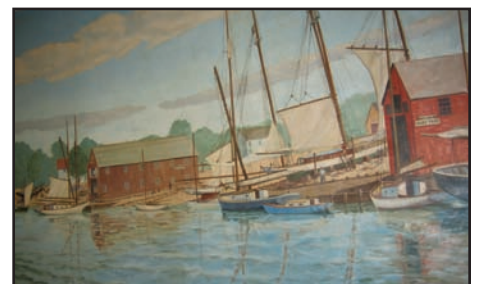
A mural, formally at the Union Savings Bank, is now on display at Patchogue-Medford Library.

Sunday, April 3 —Atlantic Wind Symphony, Patchogue Theatre, 3:00 p.m., 631-207-1313.