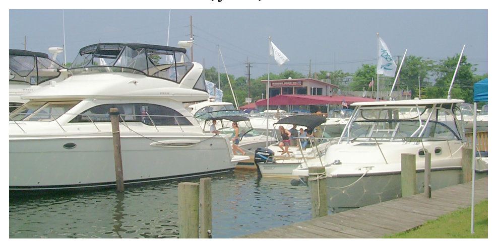
More than 40 new boats were on display along with music, food, children's entertainment, ferryboat river tours and vendors at SeaFair 2005 at the Watch Hill Ferry Terminal on June 10, 11 and 12.