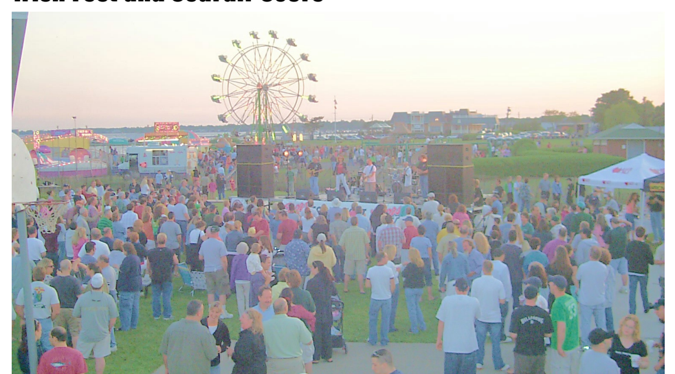
The biggest Irish talent lineup in the state was free to visitors at the Sliante Irish Festival in Shorefront Park, June 4, 5 and 6.