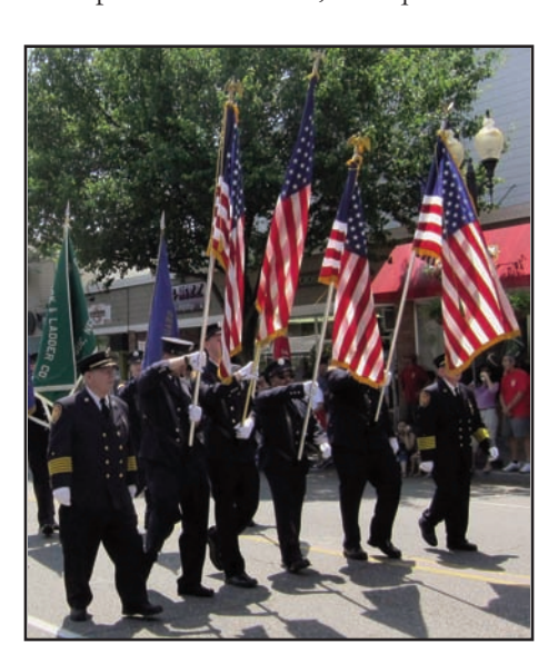
Gorgeous summer weather for this year's Memorial Day Parade.

The project will take about two years to complete and eventually contain 291 apartments and 36,000 square feet of retail.