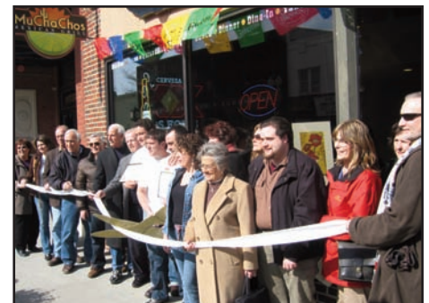
MuChaChos Mexican Grill, next to the theatre is officially open. It's owned by the Defiore restaurant family.

There are, I am sure, other arguments related to this application. They should be voiced at every opportunity. The Patchogue business community will be seriously, if not mortally, wounded if the Walmart store is built. The Chamber should mobilize its membership and speak out against this project at every opportunity. Landlords and business owners must speak out now or forever lose their opportunity to do so, to their own detriment.