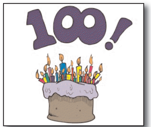
Happy Birthday Eloise: May 20