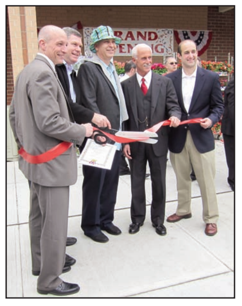
Best Market, the long awaited replacement for the shuttered Walbaums in the Swan River Commons shopping center, is open to much celebration.